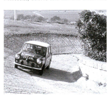
Pat Moss in the 1962 Geneva Rally.

The incredible popularity of the Mini was further enhanced by its epic encounters with much larger cars. Drivers of significantly more powerful Jaguars, Mercedes, BMWs and Lancias often had