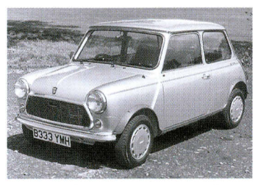
Silver 80s: the Mini Ritz.

Just as the Mini was beginning to feel its age, its fire was rekindled with a selection of exclusive variants: the first Mayfair edition from 1982 and the four London Collection models, launched between 1985 and 1987, stick in the mind. The latter included the Mini Ritz (in Silver Leaf paint finish with the first Mini alloy wheels and an interior dominated by Prussian Blue), the Targa Red Chelsea, the Mini Piccadilly, decked out - in true 80s style - in Cashmere Gold with chrome bumpers and tailpipe, and last but not least, the first Park Lane in black, with beige and black striped velvet upholstery. The limited editions were sold in Britain in production runs of