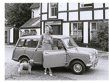
Very British: the Traveller from 1960.

ative designers and engineers to enclose this technology in a new wrapper. However, it still came as something of a surprise that the Brits would risk diluting the chrome and frill-free form of the Mini - an almost futuristic look at the time just a year after its world premiere, particularly as it was to do so with a small estate car clad with strips of wood. The Countryman and Traveller duly achieved cult status from the moment they were unveiled in 1960. The blend of avantgarde technology, timber and two small rear doors had such a leftfield panache that now even automotive traditionalists could feel comfortable as members of the Mini approval society. After all, it was now an even more practical car, offered improved access to the slightly bigger boot and had a look that was as British as a Sunday roast.